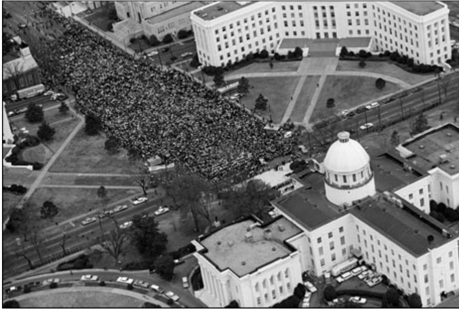
Photo 6: View of Martin Luther King, Jr., addressing the marchers at the Alabama State Capitol in Montgomery