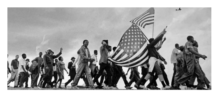
A luta continua ~ The struggle continues