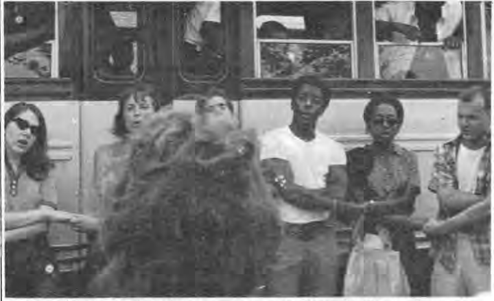
WE SHALL OVERCOME is sung as the first busload of summer volunteers leaves Oxford, Ohio for Mississippi. No incidents were reported as the first two | busloads arrived, but arrests and harassment began soon afterward.