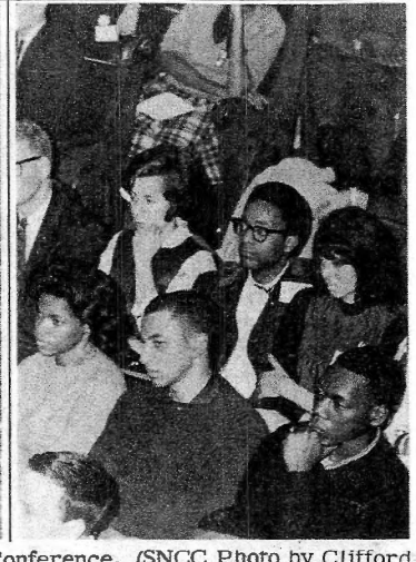
James Forman addresses SNCC Conference.