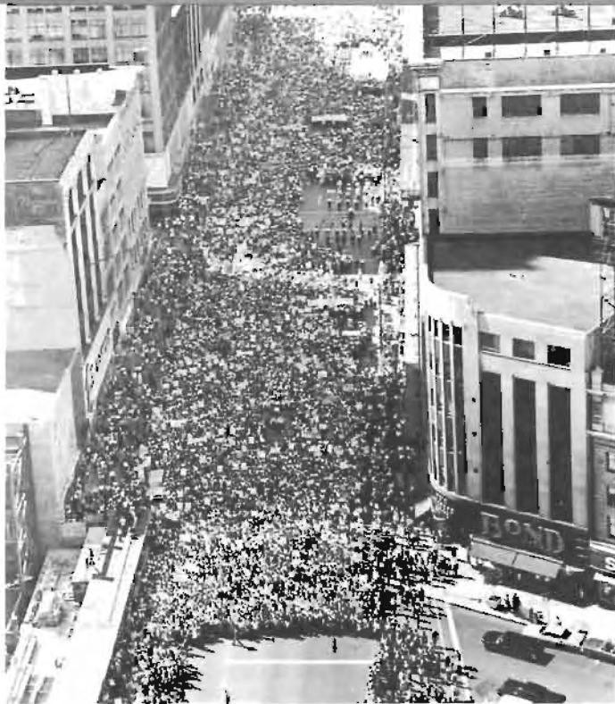
DETROIT MARCH —Preview of what was to come in the way of demonstrations occurred in Detroit on June 28 when 125,000 staged "Freedom Walk."