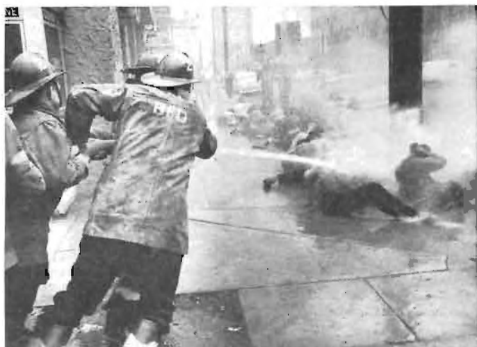
FIRE HOSES OF BIRMINGHAM —The full fury of fire hoses against demonstrators was ordered by Police Commissioner "Bull" Connor.