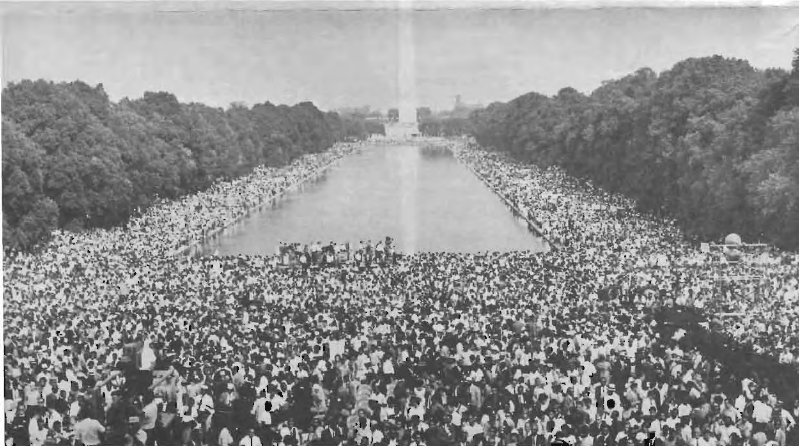
HISTORY-MAKING MARCH —In one of the most spectacular protest demonstrations ever staged in history, some 250,000 persons gathered in Washington, D. C., on August 28 to dramatize their demands for an end to discrimination. The orderly, nonviolent 'March' was telecast around the world.