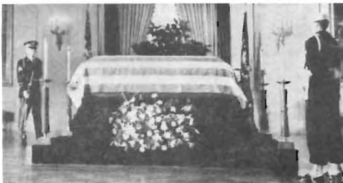
TRAGEDY IN DALLAS —A stunned nation received the unbelievably tragic news that Pres. Kennedy had been assassinated in Dallas, Texas.