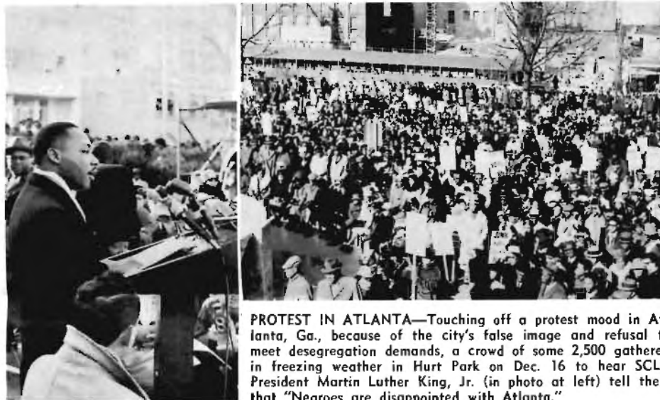
PROTEST IN ATLANTA—Touching off a protest mood in Atlanta, Ga., because of the city's false image and refusal to meet desegregation demands, a crowd of some 2,500 gathered in freezing weather in Hurt Park on Dec. 16 to hear SCLC President Martin Luther King, Jr. (in photo at left) tell them that "Negroes are disappointed with Atlanta."