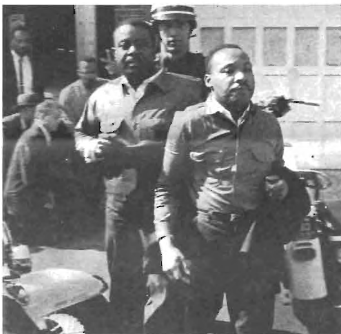
JAIL IN BIRMINGHAM —Among the 3,300 arrested in Birmingham were SCLC President Martin Luther King, Jr. and Treasurer Ralph Abernathy.