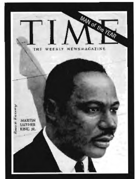
Time Cover of 'Man of The Year'