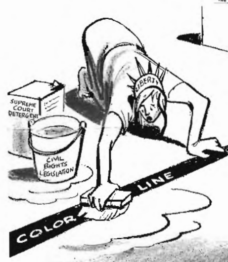
Burck In The Chicago Sun Times