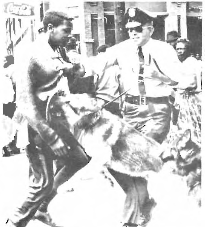
DOGS OF BIRMINGHAM —Police resistance to demonstrations in Birmingham, Ala., led to use of vicious dogs against children and adults.