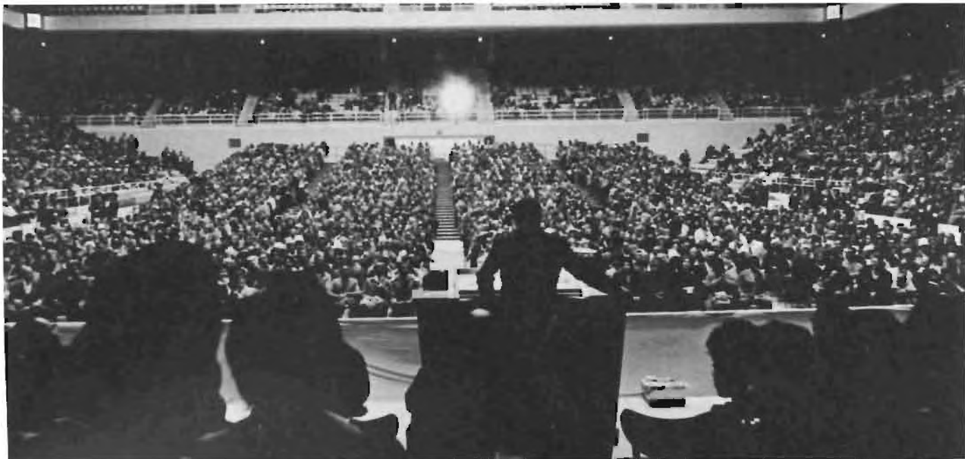
BALTIMORE HOLDS RECORD RALLY —With more than 8,000 persons in attendance at the new city auditorium in Baltimore, Maryland, on Dec. 19, a new record attendance mark was set for the South at a civil rights rally. Here, Dr. King addresses the huge mass meeting, which was sponsored by the local clergy, community civic groups and principally the Prince Hall Masons.