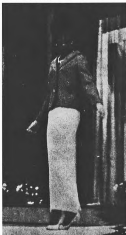
MOBILE--The first annual Artists' and Models' Fashion Show was held Sunday afternoon at Central High School. Donations went to retarded children.