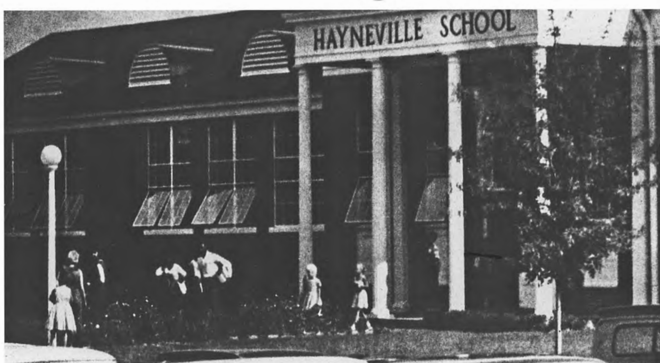
NEGRO AND WHITE CHILDREN LEAVE HAYNEVILLE SCHOOL