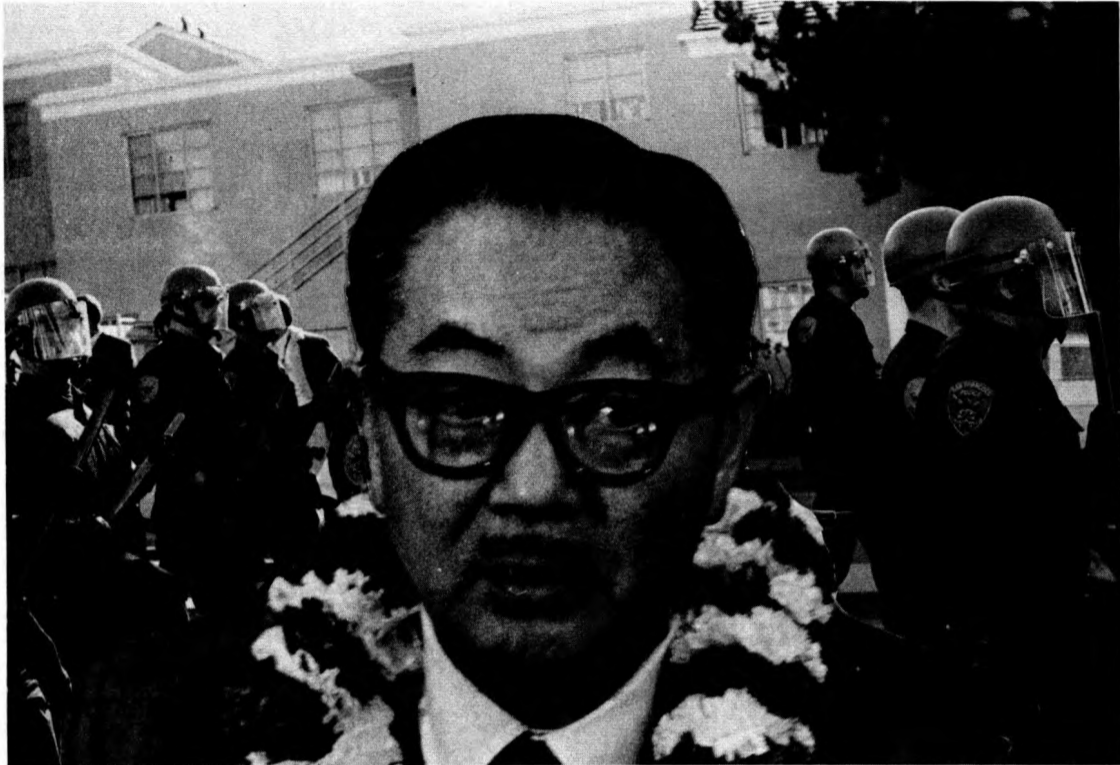
SAM I. HAYAKAWA

ALIASES: Paper Puppet, Bootlicker, Ruling Class Lackey, Flower Child