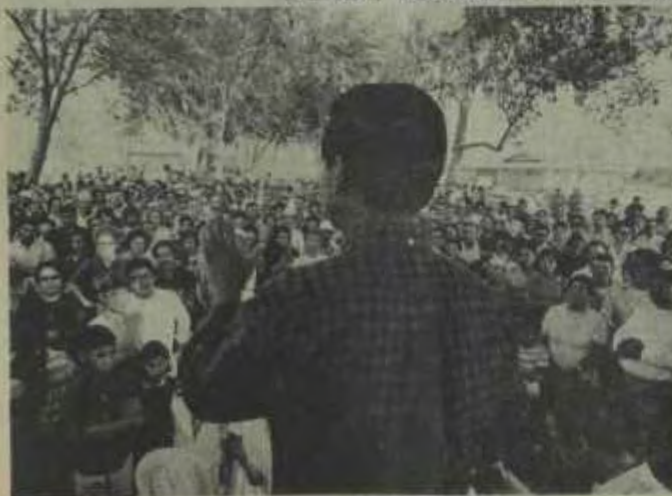
Association Meeting, September, 1965. Thousands come to hear Cesar Chavez,

Membership in the Farm Workers Association has grown steadily, from a few dozen members in 1961 to over 2,000 paid-in and dues-paying families in 1965. An additional 4,000 people have authorized the F.W.A. to act as their bargaining agents in gaining a contract. The F.W.A. is increasing benefits and services to members, with new offices to handle welfare cases, wage claims, insurance and social security. The Farm Workers Credit Union has assets of $28,000, up from just $37 in November of 1963.