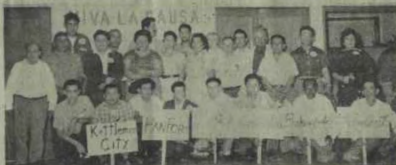
FIRST MEETING OF THE ASSOCIATION, Fresno, March, 1961