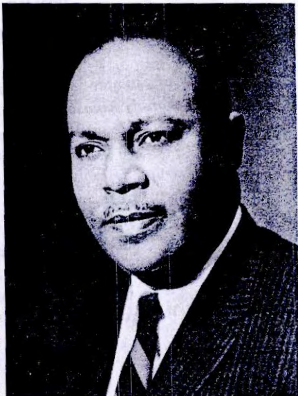
James Farmer, National Director CORE