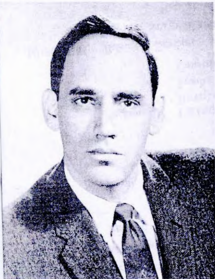
William Kunstler, ACLU lawyer and author