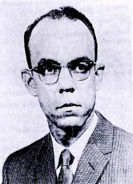
Spottswood Robinson, III, Dean Howard University Law School, Member Civil Rights Commission