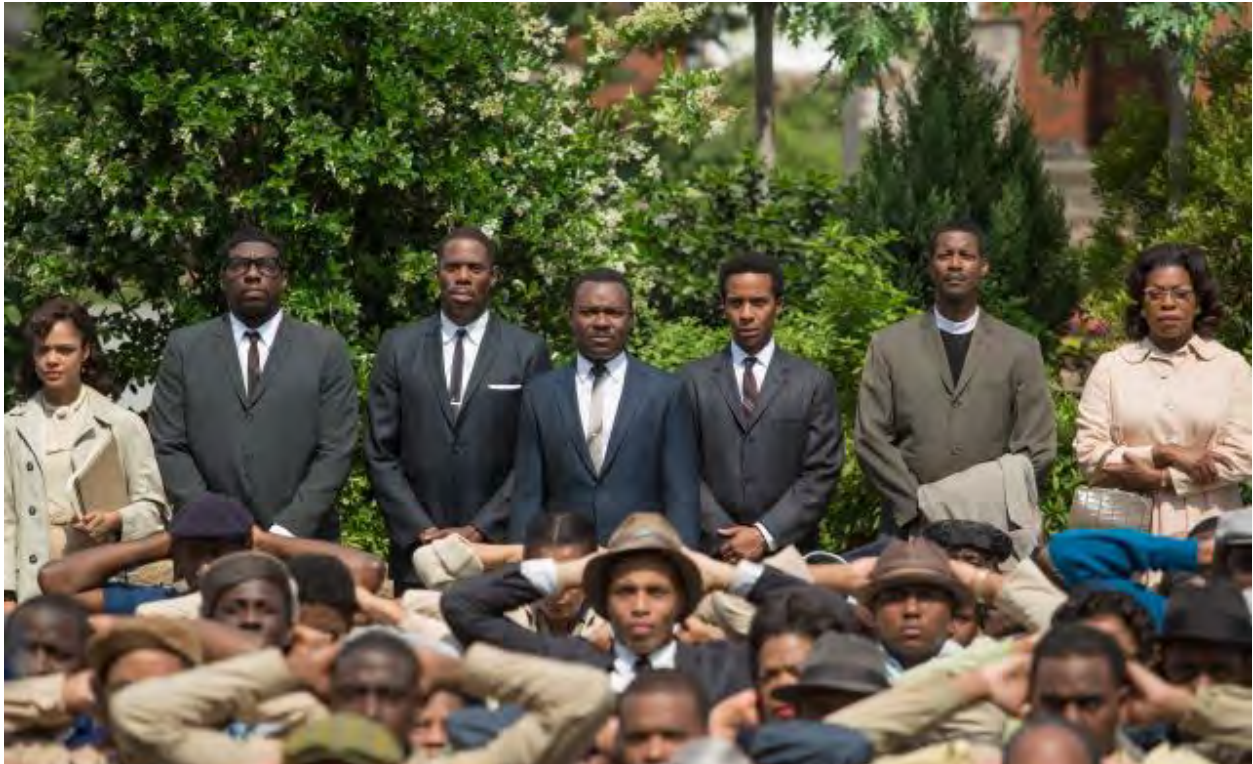
A Paramount Pictures photo of “Selma,” from left to right: Tessa Thompson plays Diane Nash, Omar Dorsey plays James Orange, Colman Domingo plays Ralph Abernathy, David Oyelowo plays Martin Luther King, Jr., Andre Holland plays Andrew Young, Corey Reynolds plays Rev. C.T. Vivian, and Lorraine Toussaint plays Amelia Boynton.

At this time when voting and other civil rights are under attack in America especially by the state and federal governments I was looking forward to the movie Selma. I was so sure it would tell the people who were not yet born 50 years ago a real view into the events of that era.