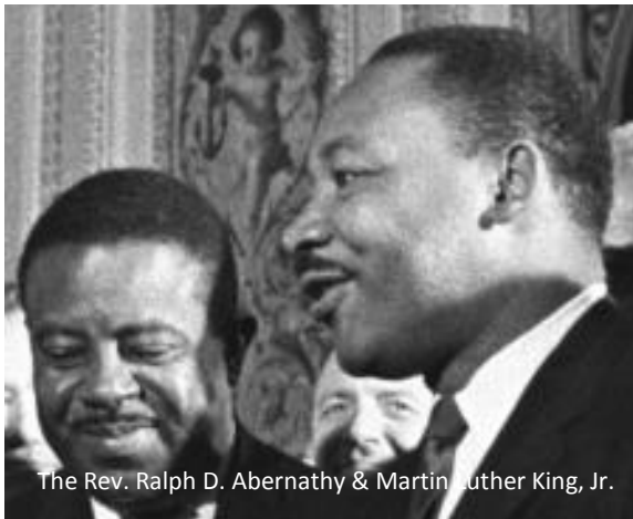
The Rev. Ralph D. Abernathy & Martin Luther King, Jr.

Mobilization to End the War in Vietnam. One year to the day they killed him.