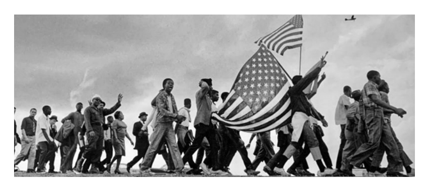
A luta continua ~ The struggle continues