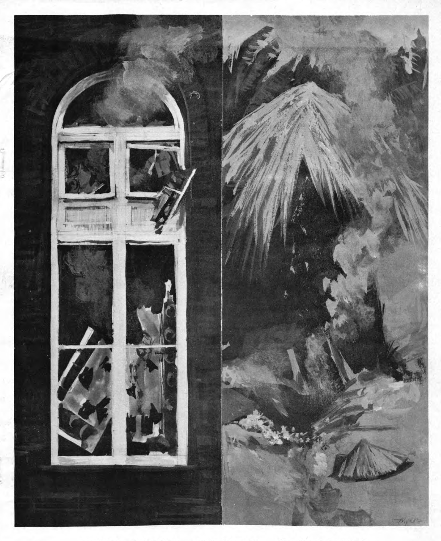
THE NEW SOUTH STUDENT