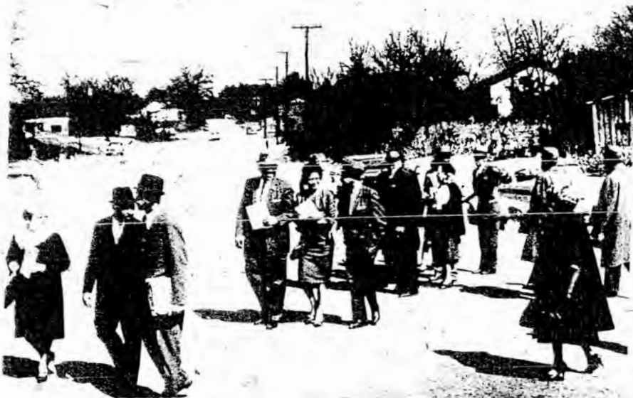
On foot, Dr. King and party start "Operation Door-Knock."